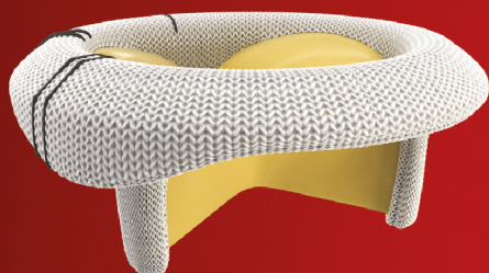
MITRIS RESILIA Mitral Valve

With Edwards Lifesciences, you have a lifetime of possibilities